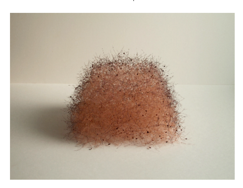
Durchlässige Form / Permeable Form, 2012, Tree blossoms, 8\times12\, 1/2 \times12\, 1/2 inches

CHRISTIANE LÖHR Jason McCoy Gallery 41 East 57th Street, 11th Floor, New York, NY 10022 March 9, 2012 - April 20, 2012