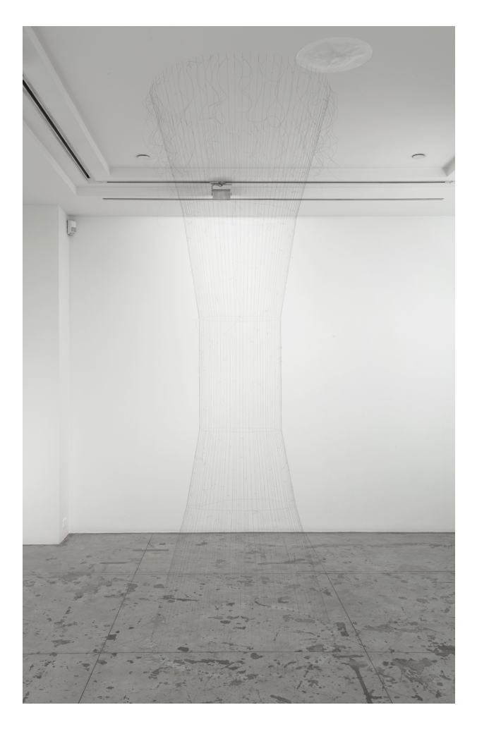
Haarsäule / Hair Column, 2012, Horsehair, needles, 113 3/4 x 39 1/2 x 39 1/2 inches

A series of drawings in black oil pastel are less impressive or wondrous than the sculptures, though they complement the organic forms of her raw material in a rather succinct way. The half dozen works on paper, all Untitled (2011), are consistently composed of dark lines that extend to the paper's edges, winding and bending like branches off a sturdy stem. They are certainly not illustrations; it's the form generated by the line that is paramount. Like her sculptures, these drawings seem most successful when they achieve a certain balance of tension and rest.